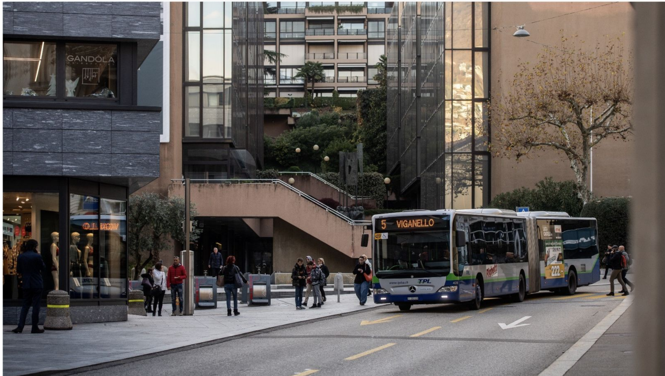
Lo stabile di via Peri offre circa il doppio di superficie rispetto a Manno.

Via libera alla convenzione tra la Città, Dagorà SA e l'Associazione Lifestyle Tech per la messa a disposizione per cinque anni degli spazi in via Peri – Il Municipio propone anche di versare 250 mila franchi annui per coprire parte dell'affitto e agevolare il trasloco da Manno